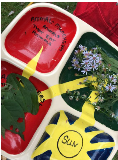
3rd/4th Grade Earthkeepers Lab