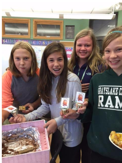
7th Grade Potato Cook-Off