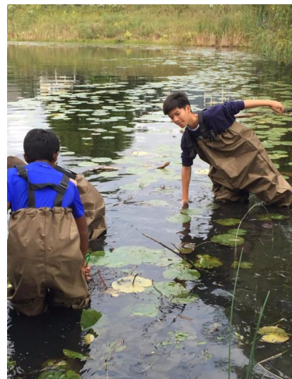
7th Grade Macroinvertebrate