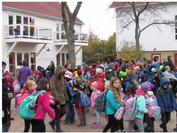
Kindergarten Apple Picking and Eat Real Assembly