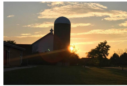
Staff member Lisa Mudge photographs the beauty of our campus at different times of day.