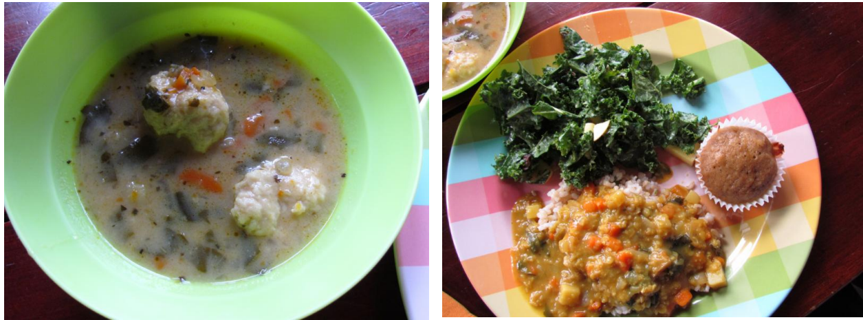
Farm to Table feast of Dal and Rice, Kale Salad, Potato Dumpling Soup & Squash Muffin!