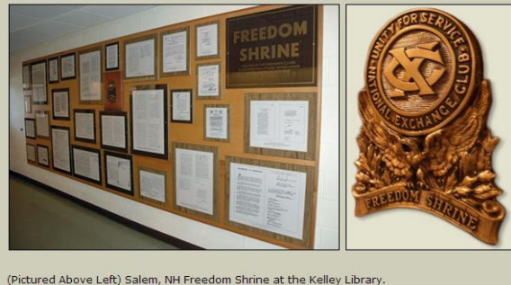
(Pictured Above Left) Salem, NH Freedom Shrine at the Kelley Library.

On Fri., April 4, students from all grades filed through the gym doors after school. This time, they were spared a class period of squats,